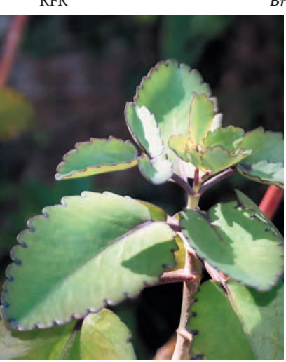
Bryophyllum imes houghtonii